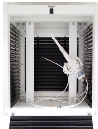
HMP155 in a Stevenson screen.

The HMP155 is especially designed for use in meteorological applications, such as synoptic and hydrological weather stations, aviation, and road weather. It is also suitable in a wide range of instrumentation, for example, recorders, data loggers, and laboratory equipment and monitoring.